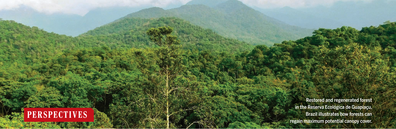
Restored and regenerated forest in the Reserva Ecológica de Guapiáçu, Brazil illustrates how forests can regain maximum potential canopy cover.